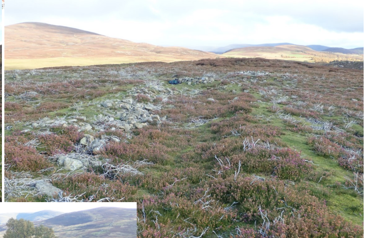
Church Site looking East