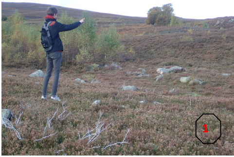
Note Tree on north west hillside, the church lies behind this to the right