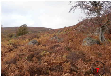
Note old tree on right, very poor track through bracken