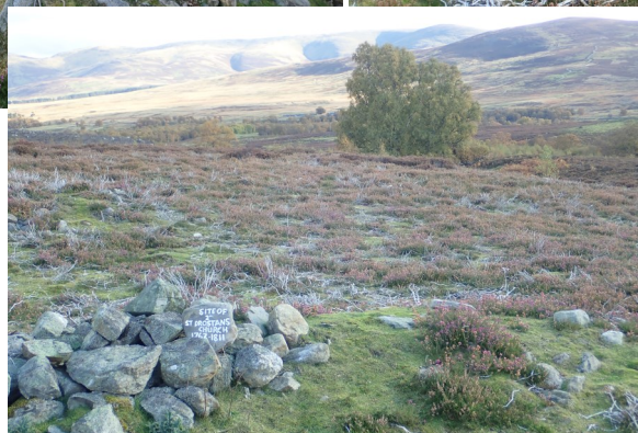
Looking South East, showing one of 4 painted stones marking corners

The 2nd Church was probably built near the site of the First St Drostan's Church which was burned down during the 1745 rebellion. Shortly after the arrival of Rev James Brown in 1763, the building of the 2nd Church was begun and completed by 98 men of the congregation. They collected stones from the hills and within a week had the walls standing and, within 3 weeks, the roof was thatched with heather, and the floor laid with earth and gravel. It was 74 ft. long and 14 ft. wide and was used until the 3rd Church was opened in 1811. (The 3rd Church was located near where the Lodge is now).