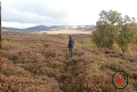
Just past "landmark" trees looking back down very indistinct path