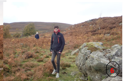
Large rock on right