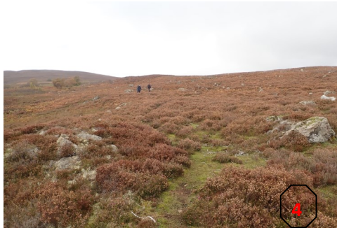
Looking up rough path towards trees