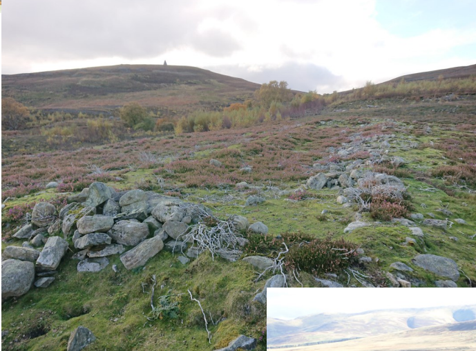
Church Site Looking South West towards Monument