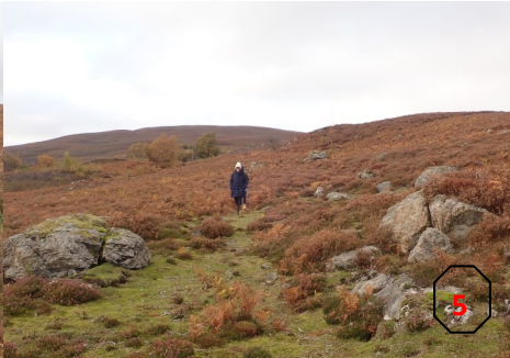
Path runs between rock outcrops