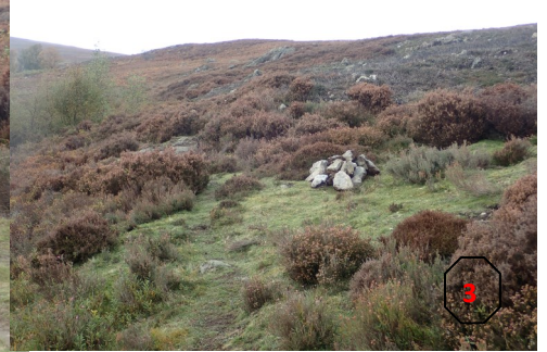
Showing rough path to left of pile of stones and landmark tree in far distance, keep to side of hill to avoid boggy ground