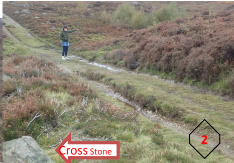
Pointing way to rough path to church, note Cross Stone in foreground