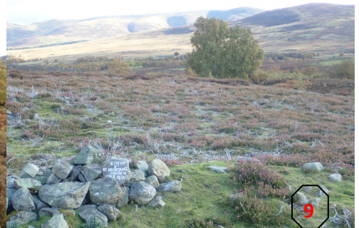
Site of Church, note landmark tree in background and painted corner stone marker